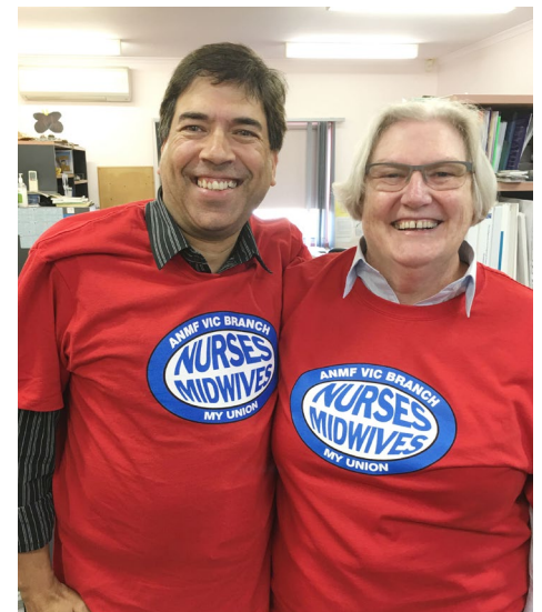
Korumburra Community Mental Health ANMF members awash in red.