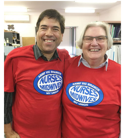
Korumburra Community Mental Health ANMF members awash in red.