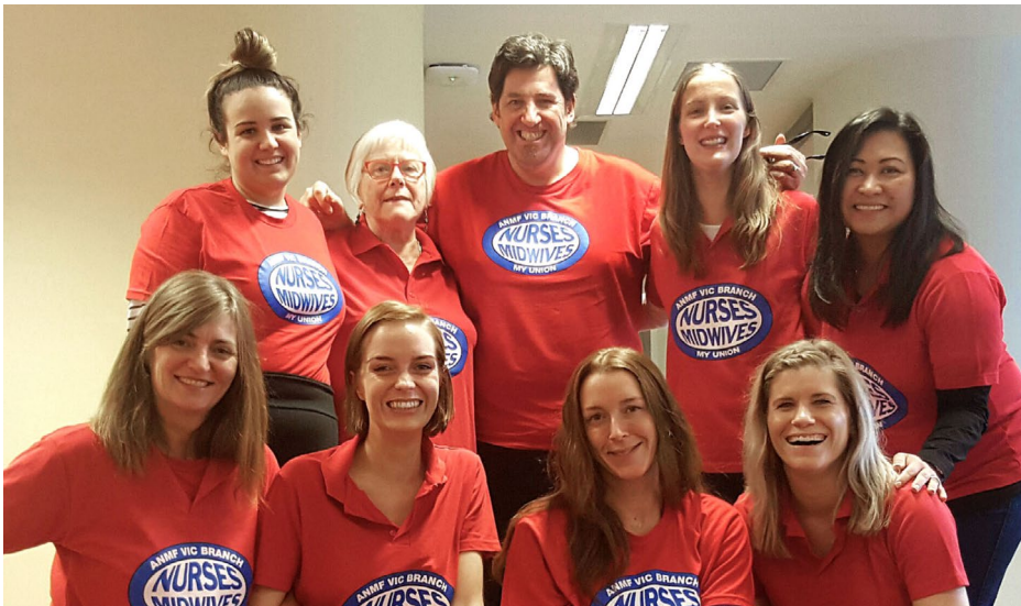
ANMF members awash in red at Saltwater Clinic Mercy Mental Health